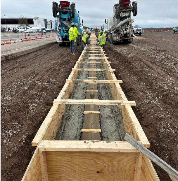
Trench Drain – Phase 5A-0