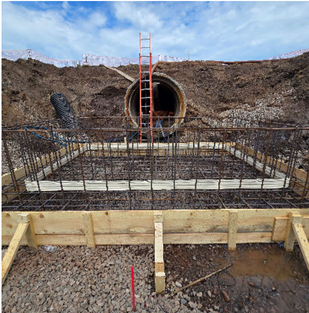
Manhole 1 – Phase 5A